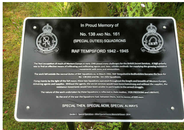
The Tempsford Squadrons rightly commemorated - at St Clement Danes’ church, and at the National Memorial Arboretum